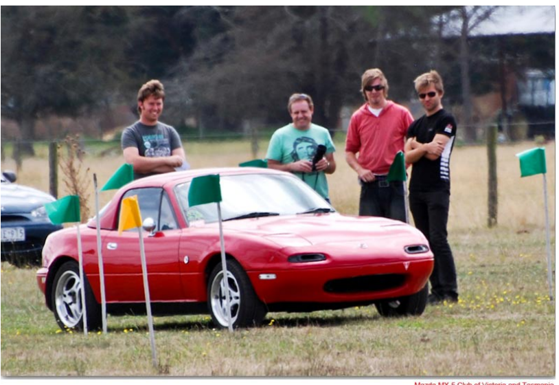
Mazda MX-5 Club of Victoria and Tasman

Group 5 and Victorian State Championship motorkhanas at www.motorkhanavic.com.au